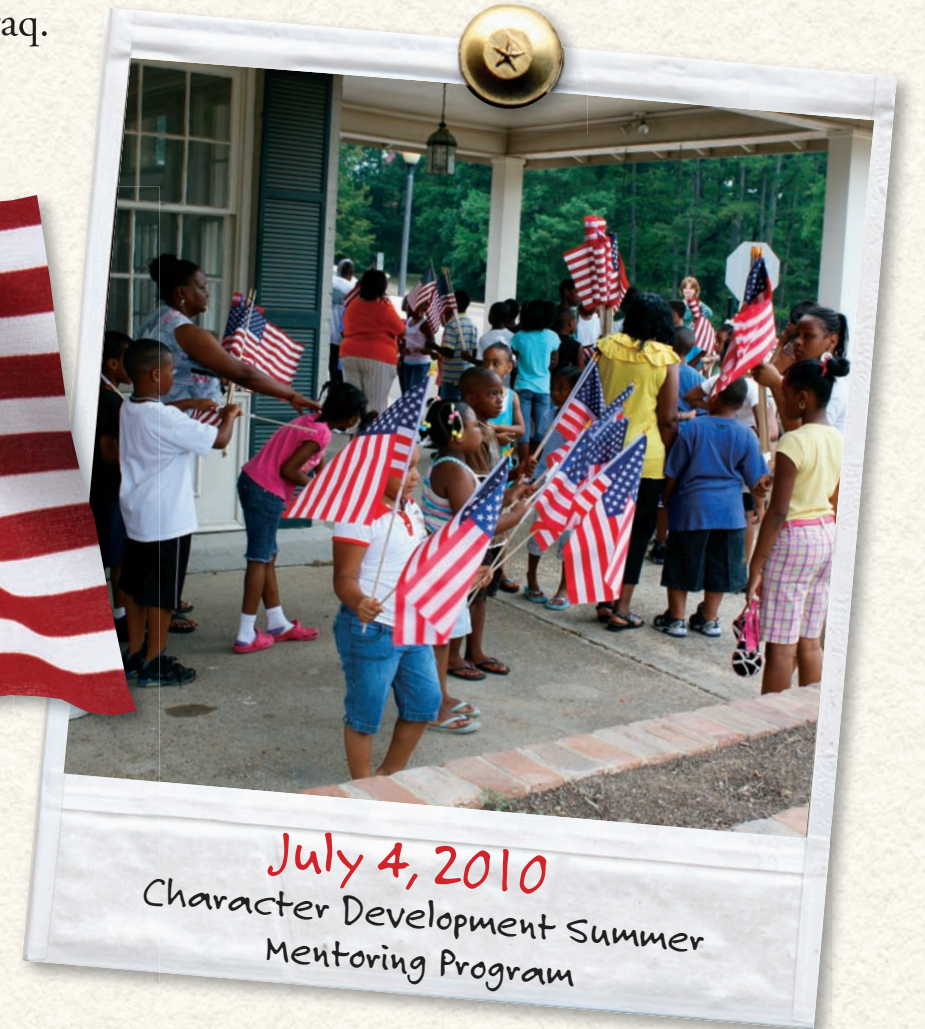
July 4, 2010 Character Development Summer Mentoring Program