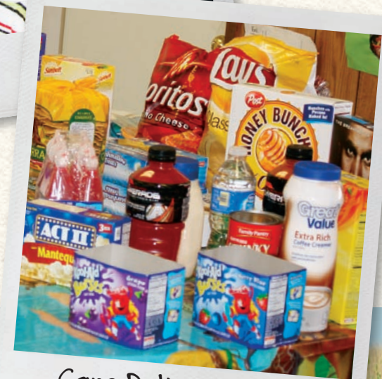
Care Delta Summer Youth Project

At Care Delta Summer Youth Project, campers learned what's in food, how to shop for healthy food, how to grow food and how to prepare it.