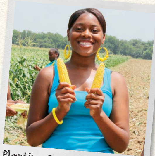
Planting Seeds for Careers In Agriculture Camp

At the Planting Seeds For Careers in Agriculture Summer Camp, put on by Indianola Main Street, interns learned about careers in agriculture from the ground up.