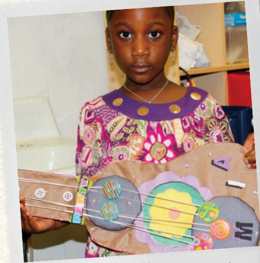
Small World Summer Camp

Campers at Small World made and played their own musical instruments.