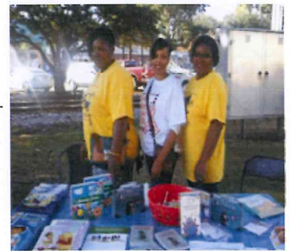
Leflore County Parent Educators

Children watch their parents and learn by what they see. Whether you are reading a recipe card or your favorite book, let your child see that you value and enjoy reading. When your child ask a question you can't answer, let your child see you look in a book to find the information.